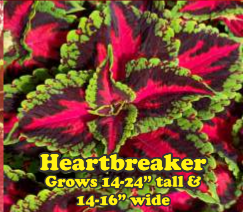
Heartbreaker Grows 14-24" tall & 14-16" wide