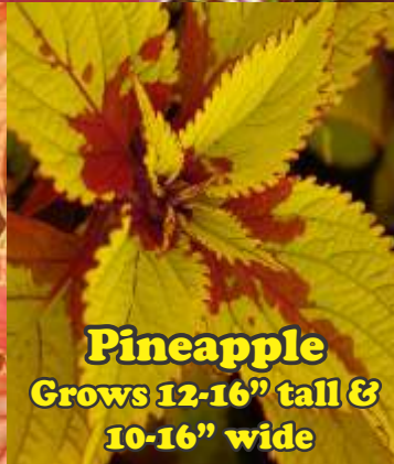
Pineapple Grows 12-16" tall & 10-16" wide