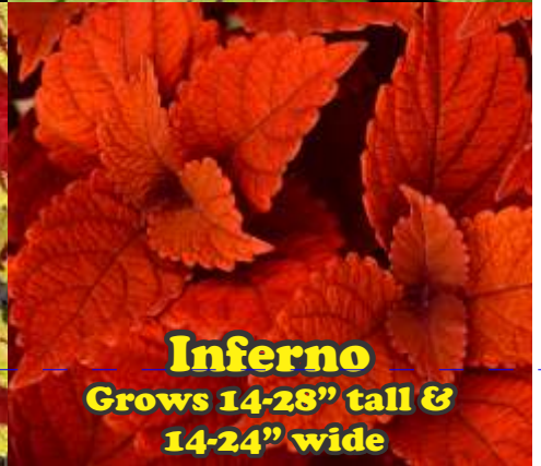
Inferno Grows 14-28" tall & 14-24" wide