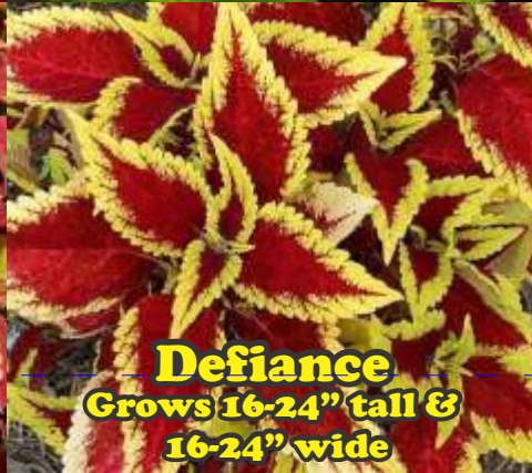
Defiance Grows 16-24" tall & 16-24" wide