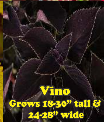
Vino Grows 18-30" tall & 24-28" wide