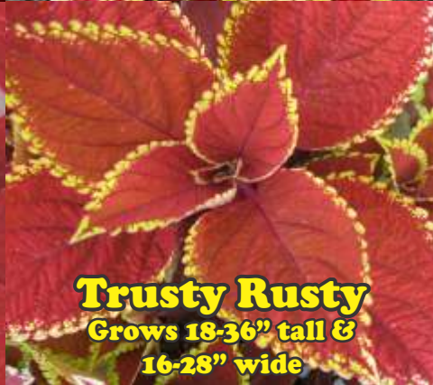
Trusty Rusty Grows 18-36" tall & 16-28" wide