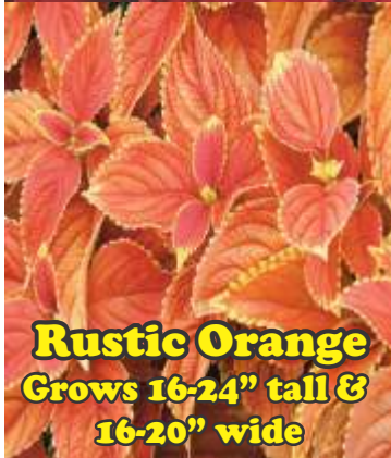
Rustic Orange Grows 16-24" tall & 16-20" wide