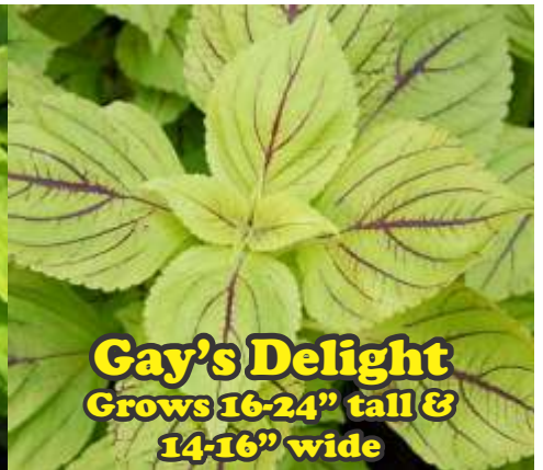
Gay's Delight Grows 16-24" tall & 14-16" wide