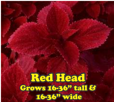
Red Head Grows 16-36" tall & 16-36" wide

These vegetative sterile coleus are as durable as it gets compared to seed varieties. Now breeders have successfully created varieties that can be grown in the sunniest spot in the garden with wonderful bright colors. Please note that some coleus colors can change color depending on amount of sunlight.