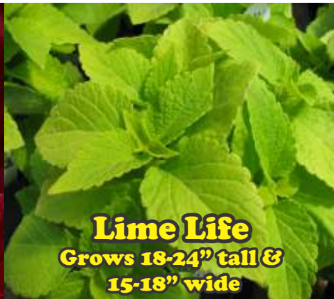
Lime Life Grows 18-24" tall & 15-18" wide