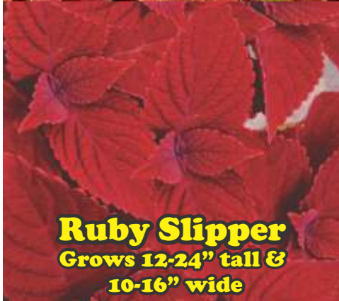
Ruby Slipper Grows 12-24" tall & 10-16" wide