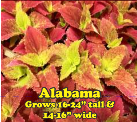
Alabama Grows 16-24" tall & 14-16" wide