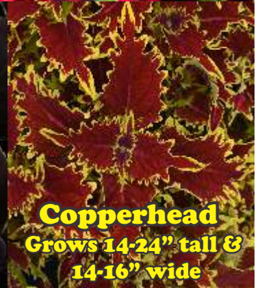
Copperhead Grows 14-24" tall & 14-16" wide